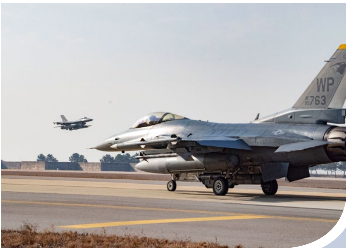
A U.S. Air Force F-16 Fighting Falcon aircraft assigned to the 80th Fighter Squadron "Juvats" taxis down the flightline at Kunsan Air Base, Republic of Korea, Jan 16, 2020. The 8th Fighter Wing is home to two fighter squadrons, the 35th FS "Pantons" and 80th FS. They perform air and space control roles including counter air, strategic attack, interdiction and close-air support missions. ◀