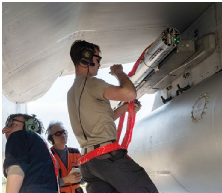
Airmen of the 18th Aircraft Maintenance Squadron arm a 44th Fighter Squadron F-15C Eagle during Exercise WestPac Rumrunner at Kadena Air Base, Japan, Jan. 10, 2020. The 18th Wing-led exercise validated new ways to deploy and maneuver assets in order to operate in contested environments. ◀