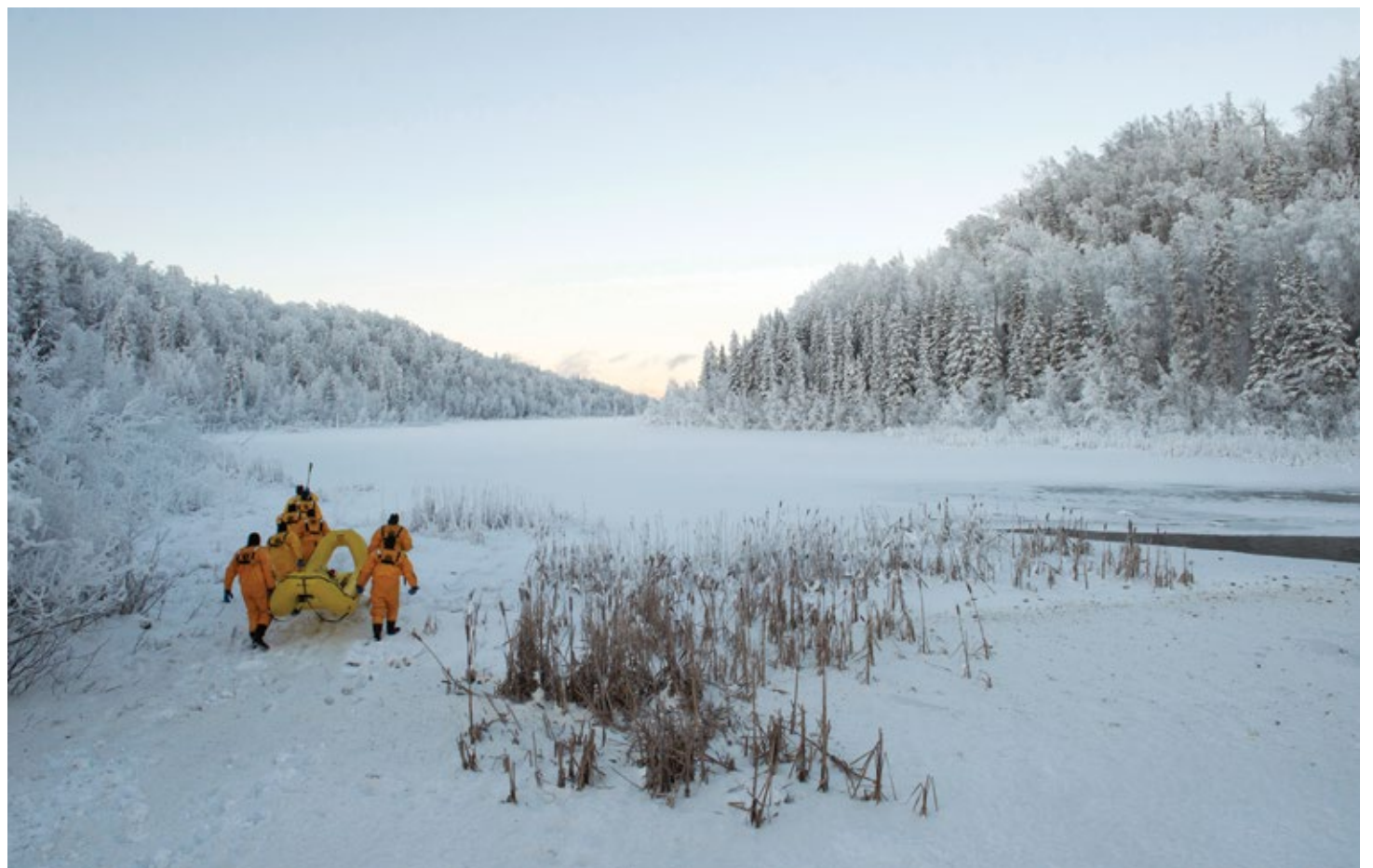
A ir Force fire protection specialists with the 673rd Civil Engineer Squadron make their way toward a frozen lake during ice-rescue training at Six Mile Lake on Joint Base Elmendorf-Richardson, Alaska, Jan. 11, 2020. JBER firefighters conducted training in subzero temperatures to gain the knowledge and skills necessary for safe rescue and recovery operations in, on and around ice and cold water. ►