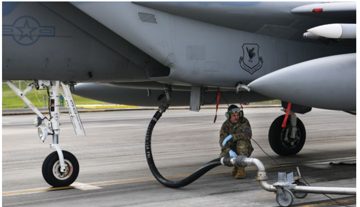
A maintainer from the 18th Aircraft Maintenance Squadron prepares to fuel an F-15 Eagle during Exercise Rumrunner at Marine Corps Air Station Futenma, Japan, Jan. 10, 2020. Airmen from the 18th Wing operate in a safe and environmentally conscious manner and adhere to strict standards set by Department of Defense and host governments at all times. ▲