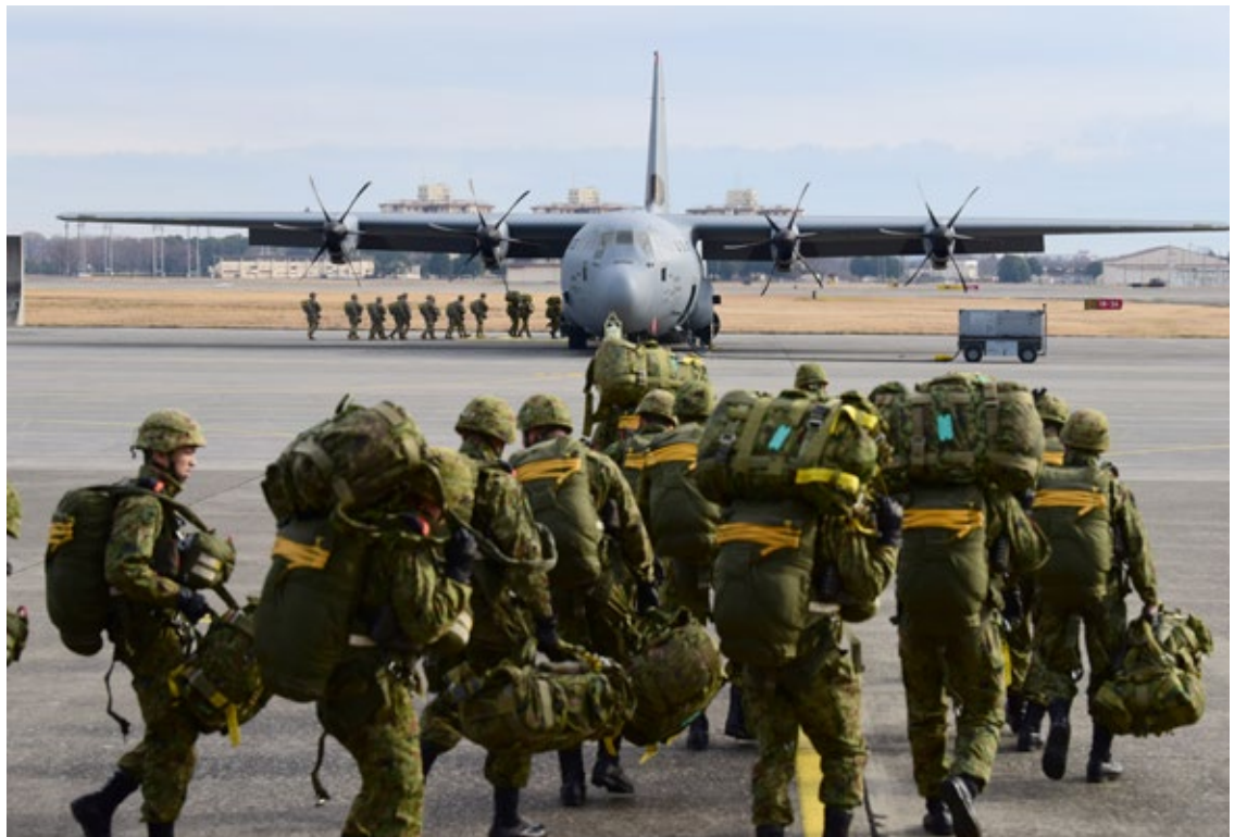
Japan Ground Self-Defense Force and U.S. Army troops file into C-130J Super Hercules aircrafts prior to the first bilateral jump event of the new year over Camp Narashino, Chiba, Japan, Jan. 12 2020. The drop consisted of three C-130Js from Yokota Air Base, two Japan Air Self-Defense Force C-130H Hercules, two C-1s, and a C-2, dropping a total of 301 U.S. Army and JGSDF jumpers. ▲