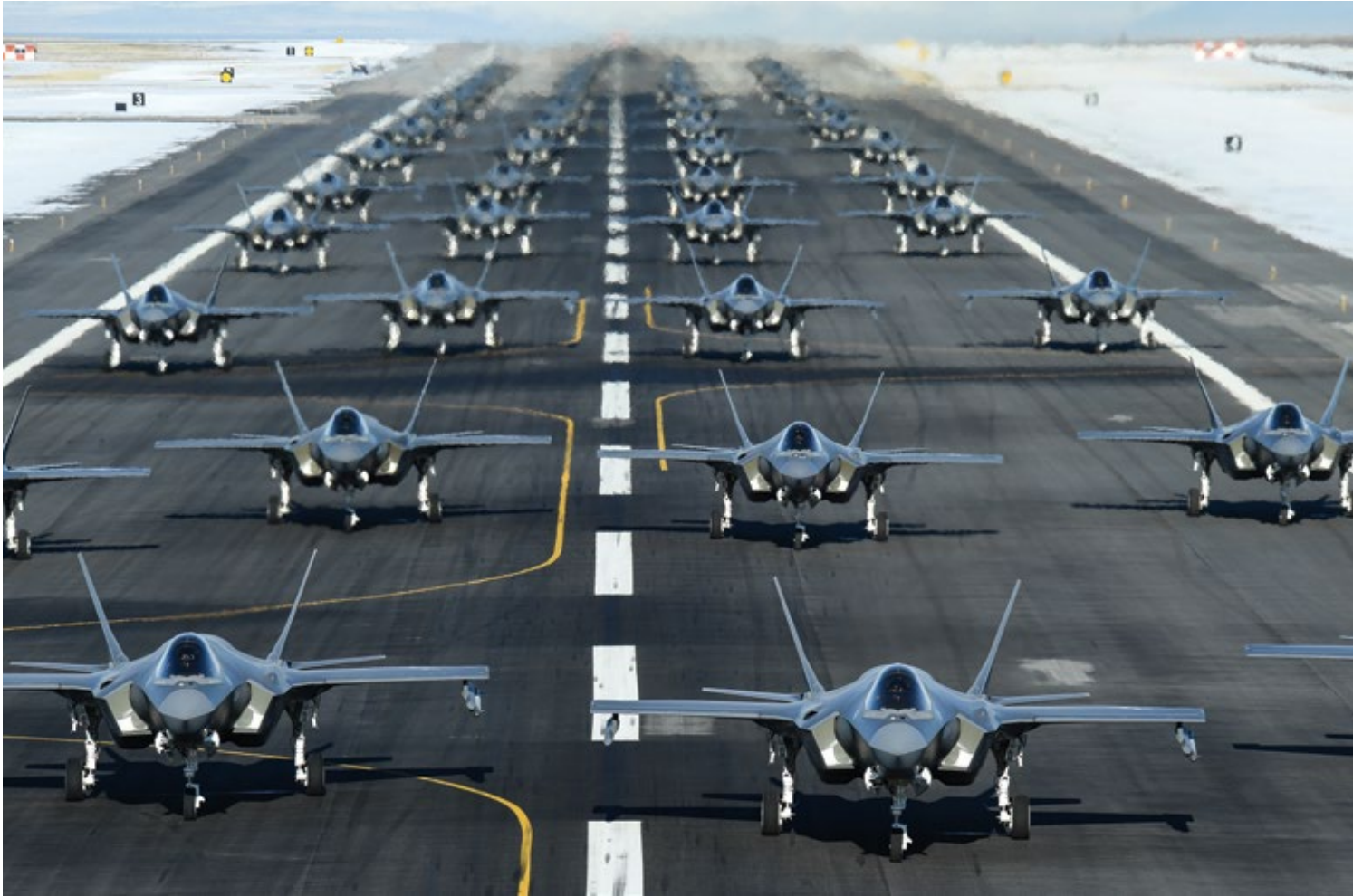
T he active duty 388th and Reserve 419th Fighter Wings conducted an F-35 Lightning II Combat Power Exercise at Hill Air Force Base, Utah, Jan. 6, 2020. The exercise demonstrated the ability to employ a large force of F-35As, testing readiness in the areas of personnel accountability, aircraft generation, ground operations, flight operations and combat capability against air and ground targets. ◀