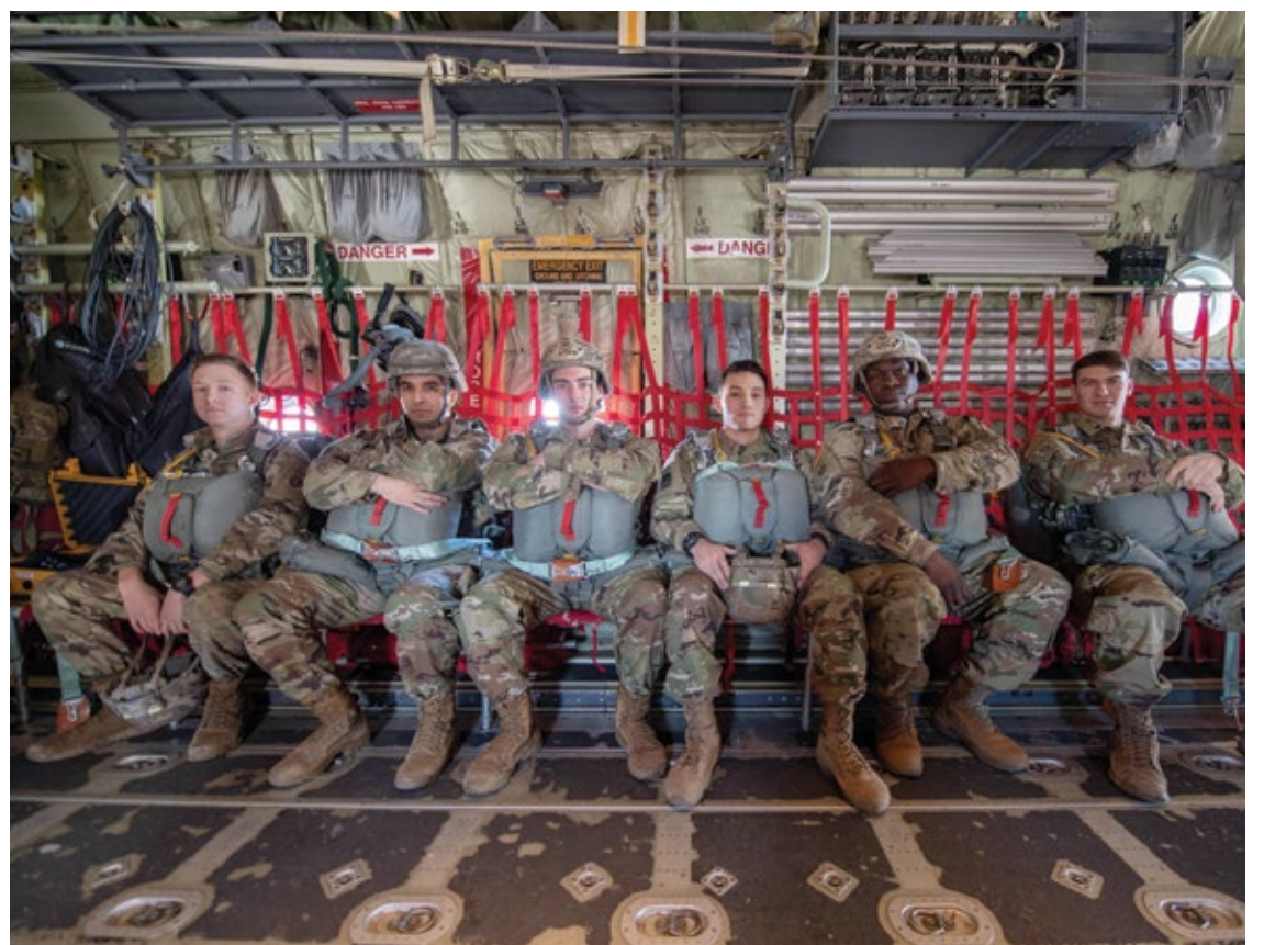
U.S. Army Reserve Alaska & 82nd Airborne soldiers prepare for Japanese Forces' annual New Year Jump aboard U.S. Air Force C-130J Super Hercules from the 36th Airlift Squadron out of Yokota Air Base, Japan, Jan. 10, 2020. The jump showcases a bilateral capability bringing military power together to train and emphasize a strong commitment to a free and open Indo-Pacific region.

The Japan Ground Self-Defense Force soldiers, with the 1st Airborne Brigade, along with U.S. Army Reserve Alaska and 82nd Airborne soldiers, jumped from the combined U.S. Air Force and Japan Air Self-Defense