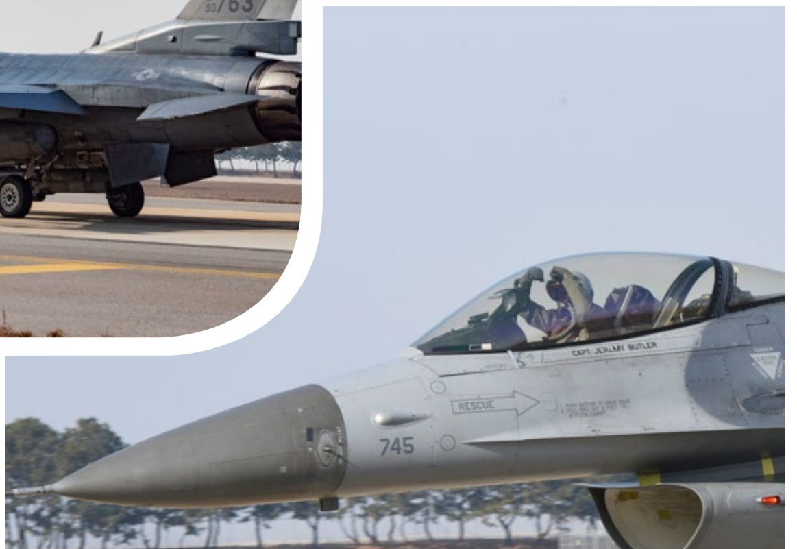
A U.S. Air Force pilot assigned to the 80th Fighter Squadron "Juvats," flashes the "crush 'em" signal while taxiing in an F-16 Fighting Falcon aircraft prior to take off during routine training at Kunsan Air Base, Republic of Korea, Jan. 16, 2020. The 80th FS was activated during World War II in 1942, as the 80th Pursuit Squadron. ▶