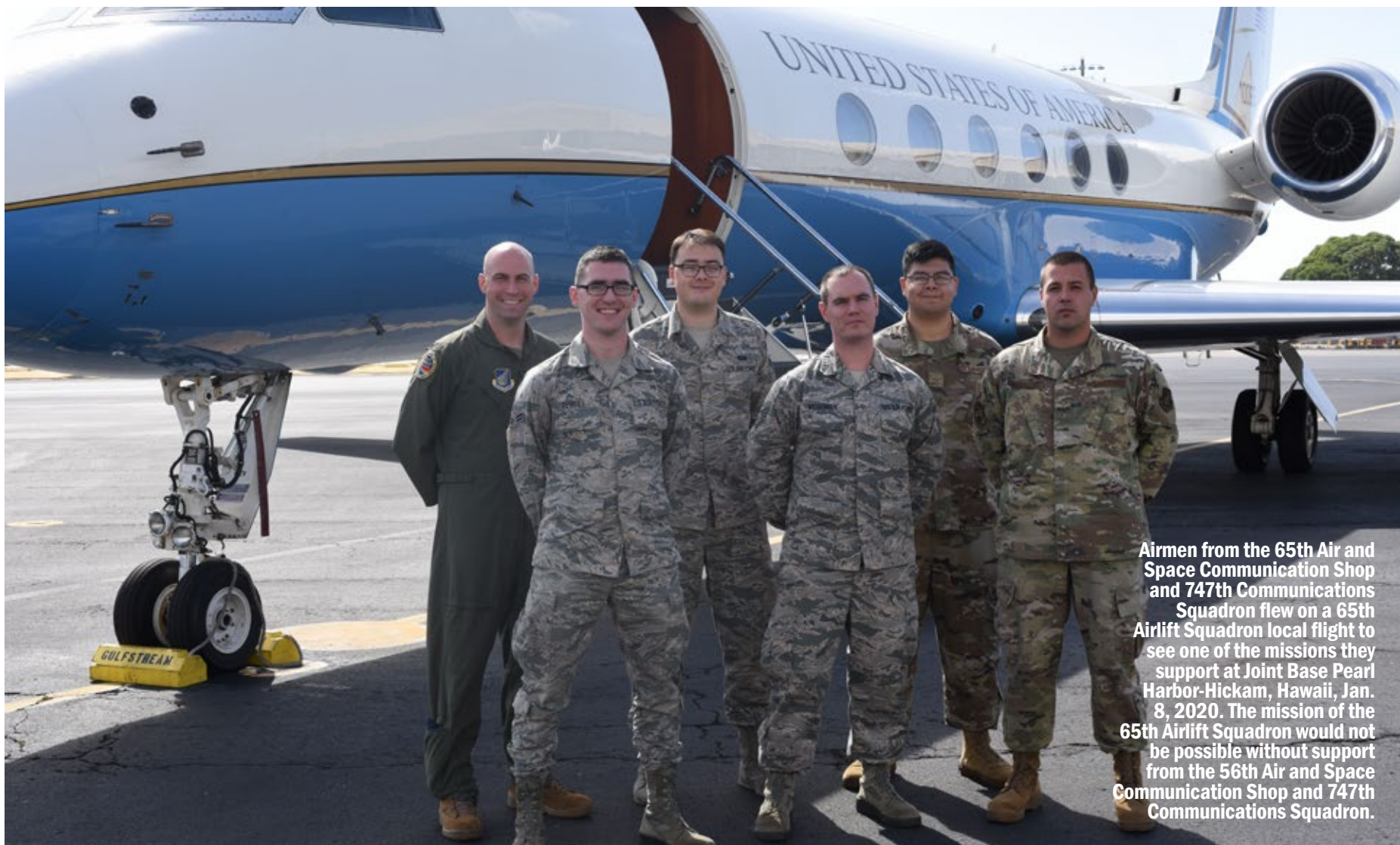
Airmen from the 65th Air and Space Communication Shop and 747th Communications Squadron flew on a 65th Airlift Squadron local flight to see one of the missions they support at Joint Base Pearl Harbor-Hickam, Hawaii, Jan. 8, 2020. The mission of the 65th Airlift Squadron would not be possible without support from the 56th Air and Space Communication Shop and 747th Communications Squadron.