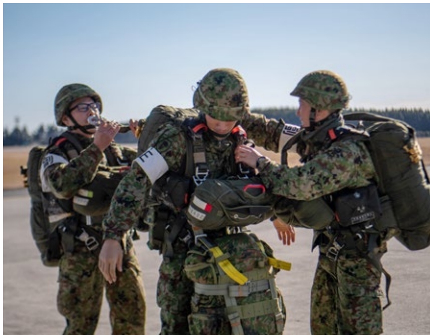
JGSDF soldiers with the 1st Airborne Brigade prepare for Japanese Forces’ annual New Year Jump outside a U.S. Air Force C-130J Super Hercules from the 36th Airlift Squadron out of Yokota Air Base, Japan, Jan. 10, 2020. The jump showcases a bilateral capability bringing military power together to train and emphasize a strong commitment to a free and open Indo-Pacific region. ▲