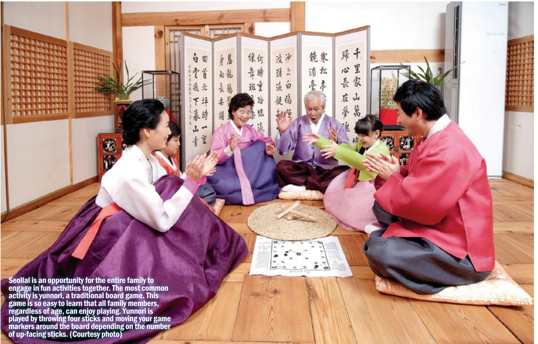
Seollal is an opportunity for the entire family to engage in fun activities together. The most common activity is yunnori, a traditional board game. This game is so easy to learn that all family members, regardless of age, can enjoy playing. Yunnori is played by throwing four sticks and moving your game markers around the board depending on the number of up-facing sticks.