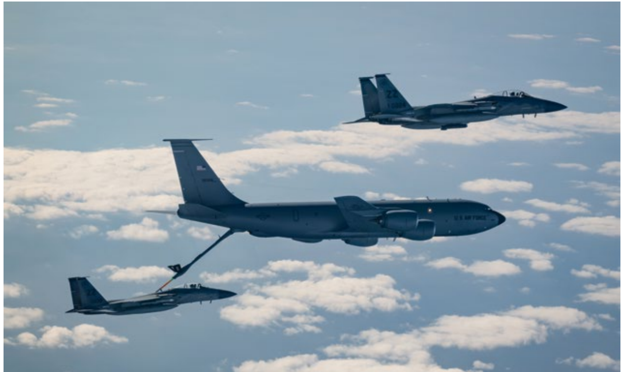
Two F-15C Eagles from the 44th Fighter Squadron refuel with a KC-135 Stratotanker from the 909th Air Refueling Squadron Jan. 10, 2020, during Exercise WestPac Rumrunner out of Kadena Air Base, Japan. Rumrunner represents an evolution in the capabilities of 18th Wing assets to work with joint partners to defend American allies and ensures a free and open Indo-Pacific. ▲