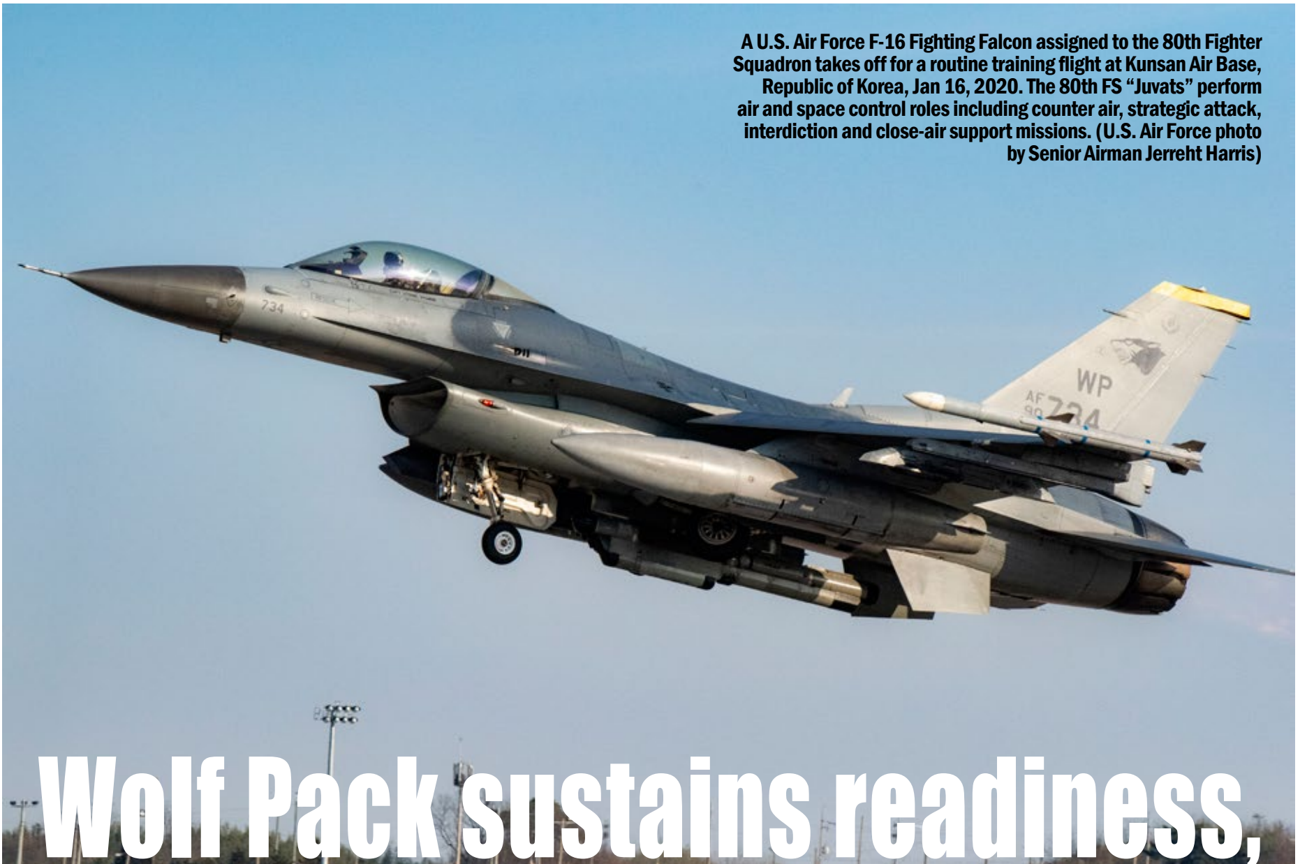
A U.S. Air Force F-16 Fighting Falcon assigned to the 80th Fighter Squadron takes off for a routine training flight at Kunsan Air Base, Republic of Korea, Jan 16, 2020. The 80th FS "Juvats" perform air and space control roles including counter air, strategic attack, interdiction and close-air support missions.