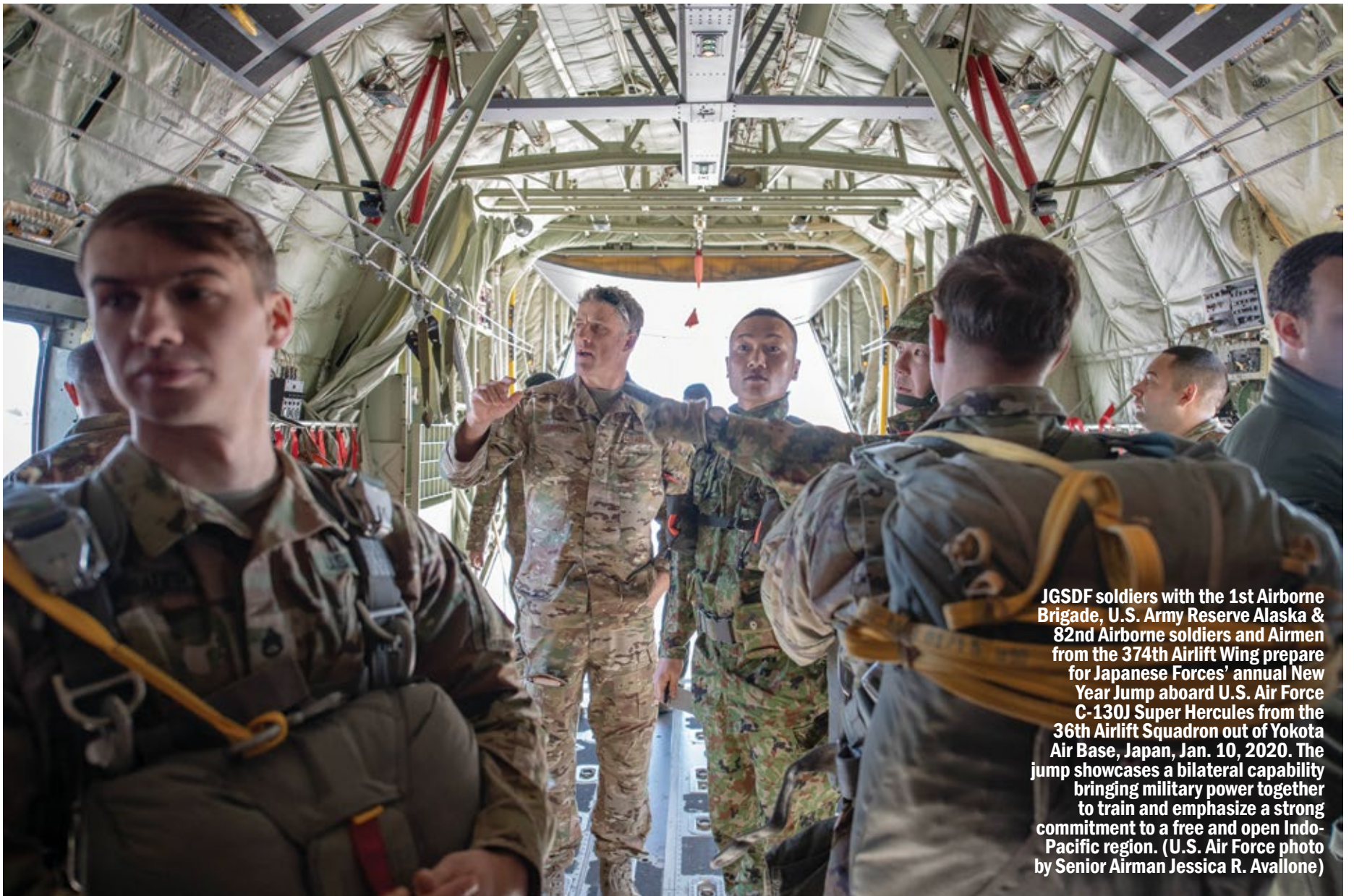
JGSDF soldiers with the 1st Airborne Brigade, U.S. Army Reserve Alaska & 82nd Airborne soldiers and Airmen from the 374th Airlift Wing prepare for Japanese Forces' annual New Year Jump aboard U.S. Air Force C-130J Super Hercules from the 36th Airlift Squadron out of Yokota Air Base, Japan, Jan. 10, 2020. The jump showcases a bilateral capability bringing military power together to train and emphasize a strong commitment to a free and open Indo-Pacific region.